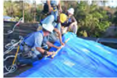
Contractors install roofing material for Project Blue Roof in this Florida photo from the Army Corps of Engineers. Emergency recovery programs such as this could suffer under a suggestion that Trump use the money for his proposed border wall.

"We are opposed to this approach, without question. These funds were approved by Congress and the White House specifically for the recovery, and it is simply improper for the president to now siphon off the funding to the wall - a fifth century solution to a modern-day challenge," Plaskett said in a statement Monday. The Army Corps of Engineers has maintained a presence in the territory since the 2017 hurricanes, working on various initiatives from rooftop programs to shoreline cleanup and restoration.