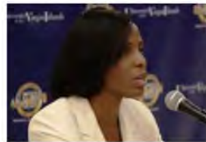
Delegate to Congress Stacey Plaskett (File photo)

Congressional Delegate Stacey Plaskett (D-VI) and Puerto Rico's Resident Commissioner Jennifer Gonzalez Colon (R-P,R) plan to introduce a joint letter to the Trump White House opposing any attempt to strip storm-recovery money from the Army Corps of Engineers to fund President Donald Trump's proposed border wall.